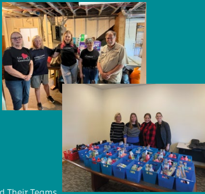
Left photo: Members of Mount Zion Lutheran Church of Hudson Right photo: The River Falls Financial Advisors of Edward Jones and Their Teams